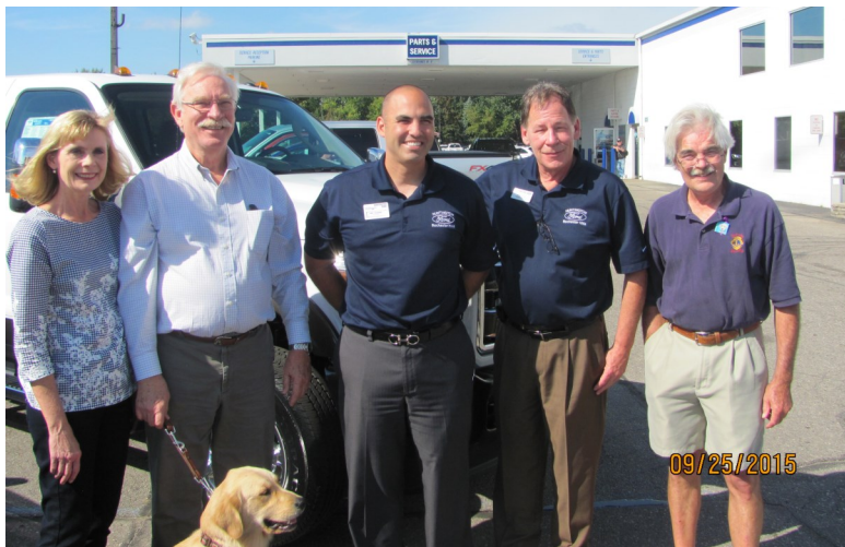
← The winner of the 2015 Mustang raffle picking up his new vehicle. He chose a Ford truck instead